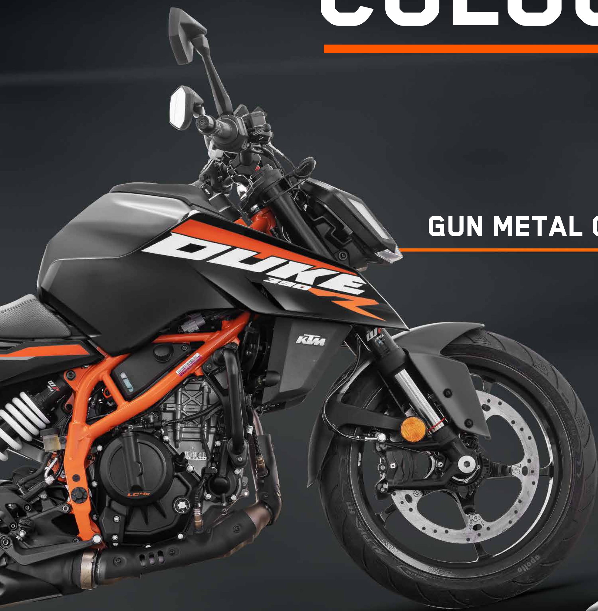
GUN METAL GRAY